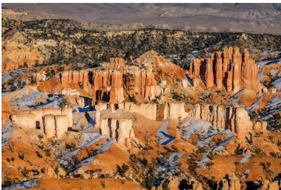
Bryce Canyon National Park

Hotel breakfast, embark on your tour to Bryce Canyon National Park , a fantasyland of hoodoos, bizarre rock formations and sandstone pillars. The unique landscape sets it apart from other national parks, we recommend a hike through a garden of hoodoos, take in the view from multiple vantage points and thoroughly explore the park.