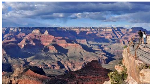
Grand Canyon National Park

Breakfast at hotel, drive through the breathtaking Oak Tree Canyon before arriving at the Grand Canyon National Park . Stop at the South Rim to fully experience this mile-deep colorful canyon's plunging gorges and rising spires formed by the mighty Colorado river. Continue to the town of Page, check-in and relax.