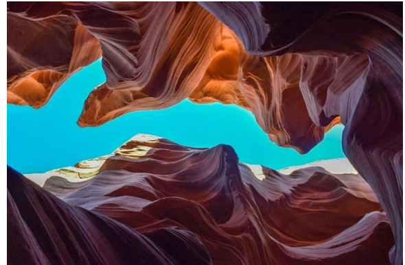
Lower Antelope Canyon

Enjoy breakfast in the comfort of your hotel, check-out and you will be driven to Lower Antelope Canyon for your morning tour. Lower Antelope Canyon is also known as The Corkscrew and you will see why as you explore the winding narrow passageways. Amazing photos can be taken every step of the way in this incredible section.